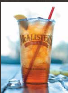
— McAlister's — Famous Sweet Tea

With lemons, sweeteners, cups, lids and straws • 7.50